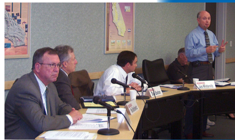
An expert panel briefs the RWA Board.

quest to resolve the water supply and environmental crisis in the Sacramento-San Joaquin Delta.