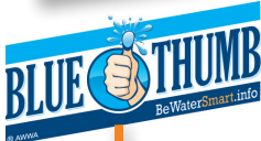
RWA's WEP popular "Blue Thumb" Campaign launched in May 2010.