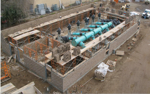
ARBCUP Project Sites

"It's becoming clear that regions that come together and develop regional plans are way ahead of the game. I applaud your efforts and encourage you to do more." – Former State Senator Jim Costa, May 2003 (later elected to Congress)