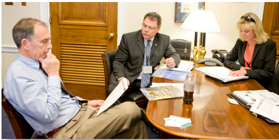
RWA members brief Congressman Pete Visclosky on the Metro Chamber Cap-to-Cap trip.

On issues such as Delta solutions and governance, water rights decisions, water conservation requirements and regulatory approval of new water storage strategies, RWA has provided a strong voice and helped raise the region's clout on statewide water matters.