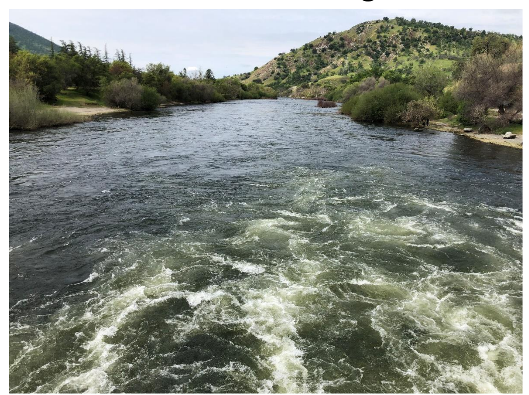
Headwaters of the Kings River