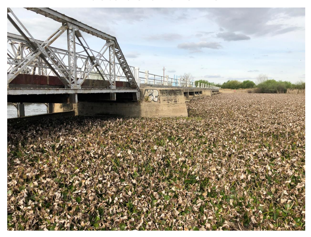
Eastside of the weir