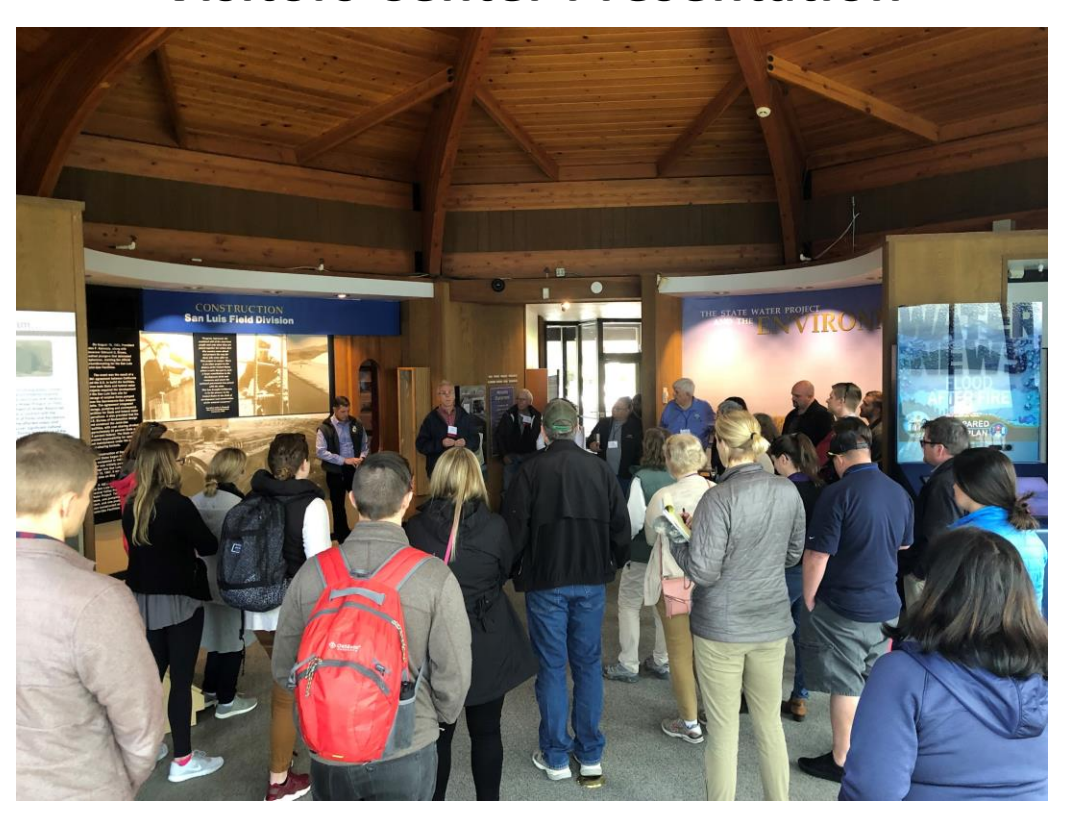
Visitors Center Presentation