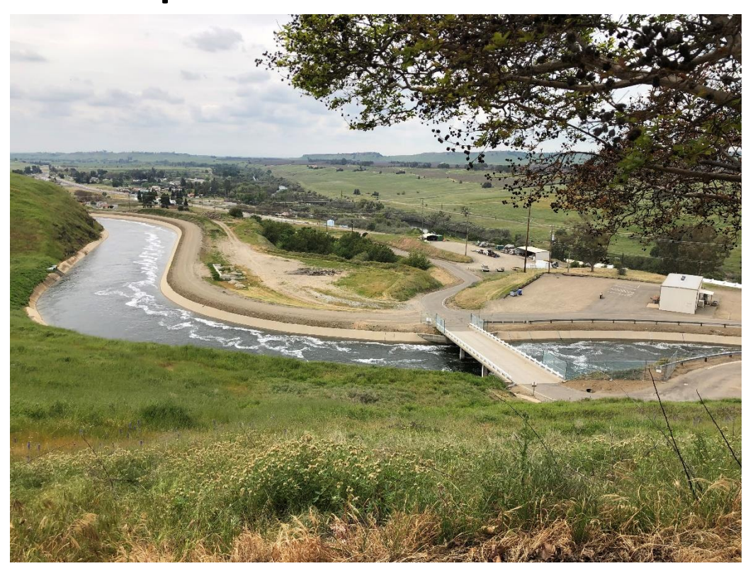
San Joaquin River and Kern Canal