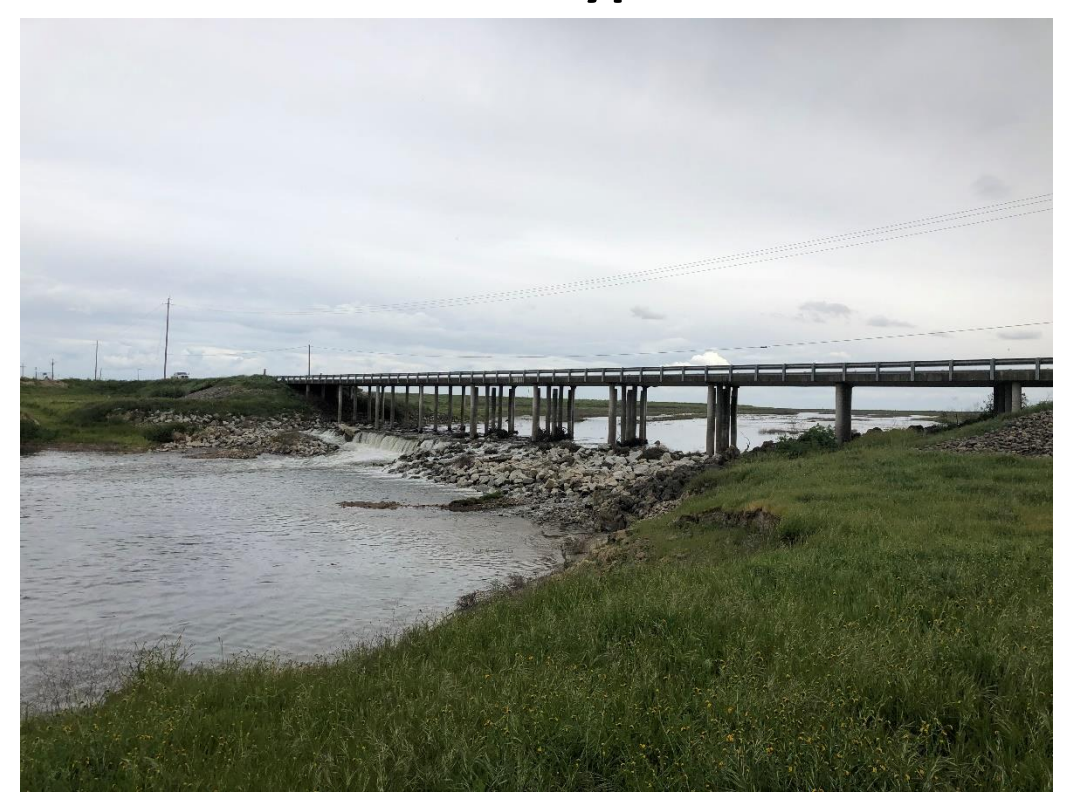
Flood water bypass area