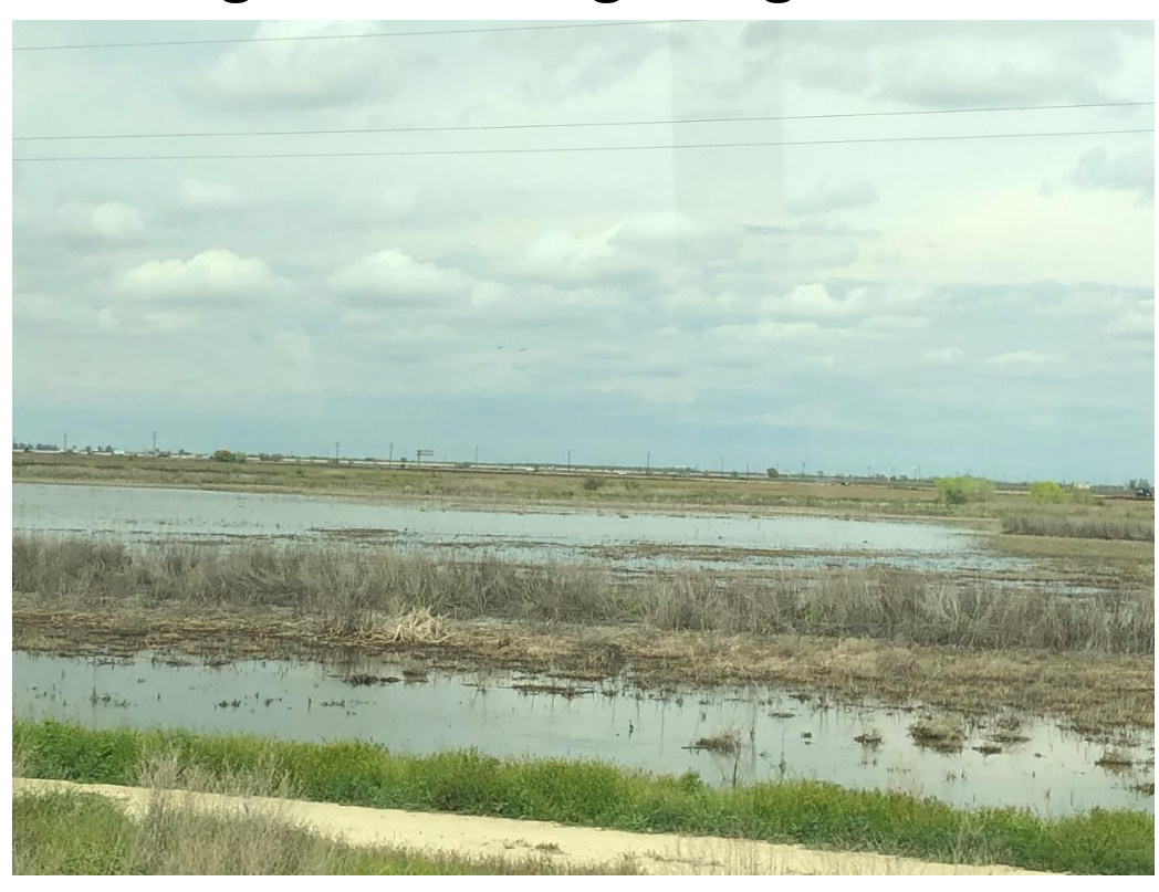
Breeding habitat for black-neck stilt