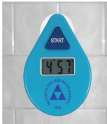
Shower Timer Item #770039