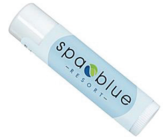
SPF15 Mineral Lip Balm Item #8886