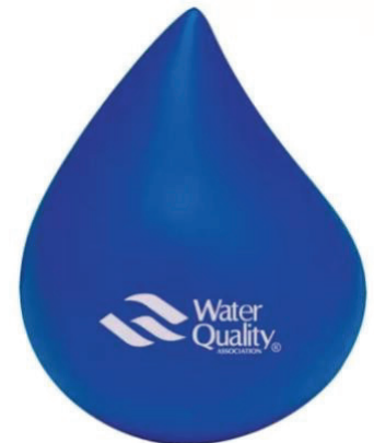
Blue Water Drop Stress Ball Item #340