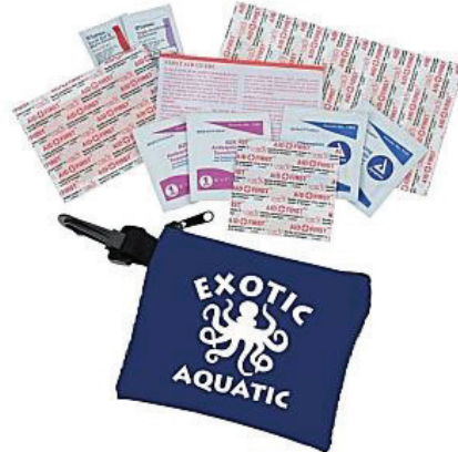
First Aid Kit Item #153315