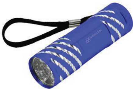
Astro LED Flashlight Item #118096