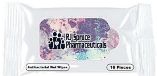
Antibacterial Wet Wipe 10 Pack Item #158720