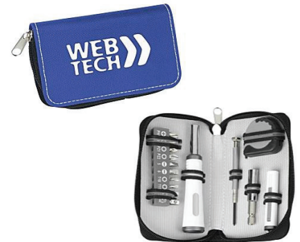
Tool Kit Item #122912