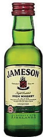
Mini Whiskey (50ML) with custom label