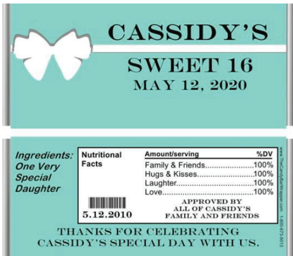
Custom Candy Bar Wrappers Item #CU544