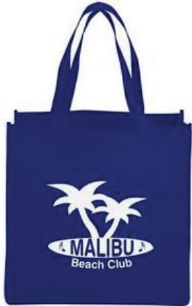
Tote Bag Item #5938-1313