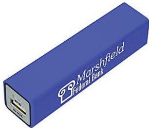
Colorblock Power Bank Item #128645