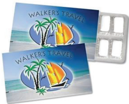
Chewing Gum Item #8732