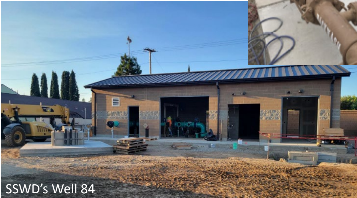
SSWD's Well 84