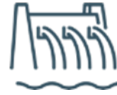
American River Flows and Operations