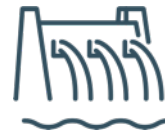
FLOWS AND OPERATIONS