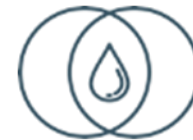
Regional Water Supply Reliability