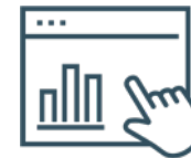
SCIENCE AND MONITORING