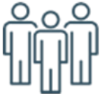
Governance, Funding and Administration